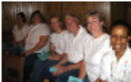
Dimensions of Faith are all smiles!