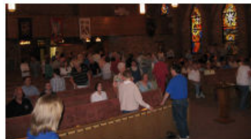
Our Saturday night Meet & Greet!