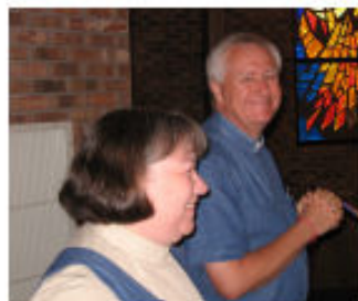
Our pastors loooove bluegrass!